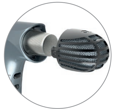
Unique dual filter design for ultimate motor protection. Removable back filter to easily clean internal filter with total 360° access. Cleaning brush included.