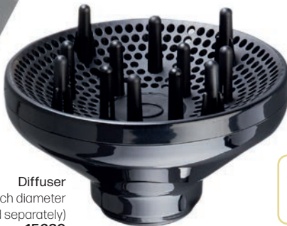
Diffuser Snap-on, 5 inch diameter (sold separately) 15639