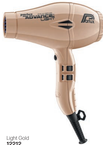
Light Gold 12212