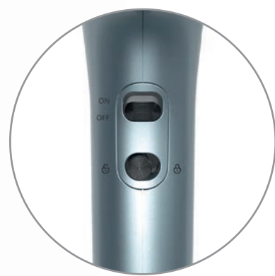
Lock button conveniently locks settings while in use