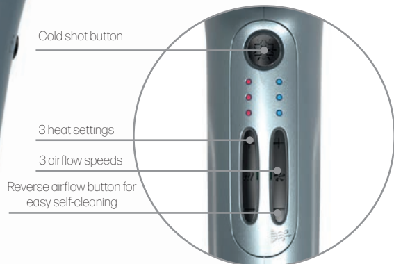
Cold shot button 3 heat settings 3 airflow speeds Reverse airflow button for easy self-cleaning