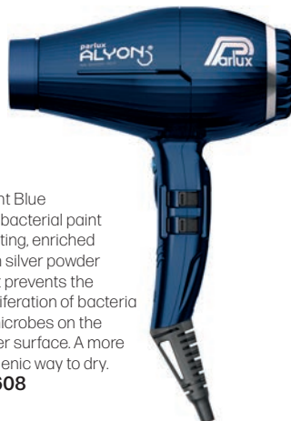
Night Blue Antibacterial paint coating, enriched with silver powder that prevents the proliferation of bacteria & microbes on the dryer surface. A more hygienic way to dry. 16608