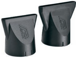
Spare Advance Nozzles, 2 Pack (Large & Small) 13692