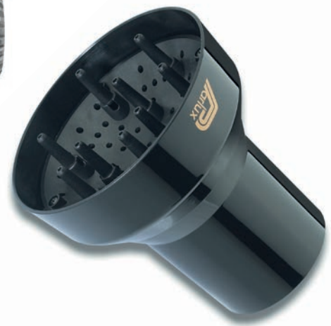
Diffuser for 3200 PLUS 15630