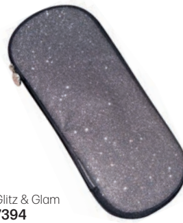
Glitz & Glam 7394