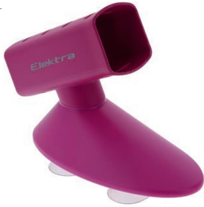
Elektra Ceramic Iron Holder Purple 4555