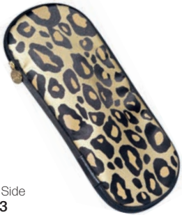
Wild Side 7393