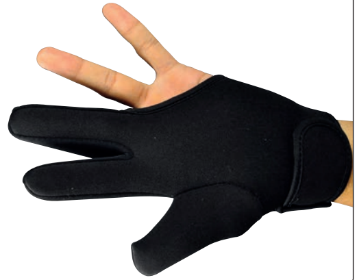
Heat-Resistant Glove 2 fingers & thumb Black 5873