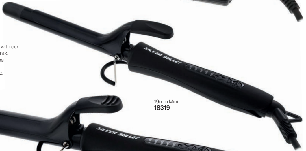
19mm Mini 18319