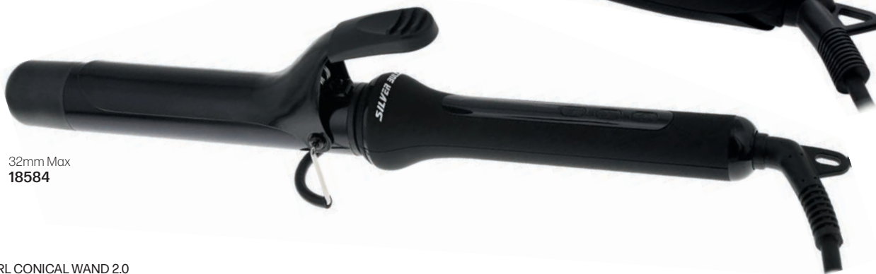
32mm Max 18584