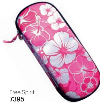
Free Spirit 7395