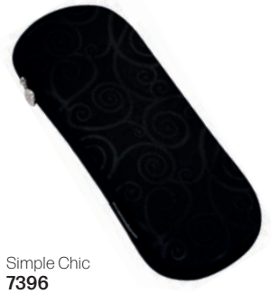
Simple Chic 7396