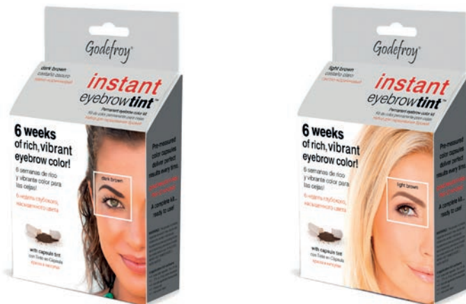
Dark Brown 16706

Permanent eyebrow tint with 6 weeks of rich, vibrant color. Easy to apply in less than 2 minutes. A great alternative for individuals sensitive to traditional hair color. Contains no hydrogen peroxide or synthetic dyes. Formulated with plant extracts, this fast-acting, gentle formula delivers rich, long-lasting color. Covers the most resistant grey hair. Each box contains cream colorant, 3 x gel activator, applicator stick, work station cards & instruction manual.