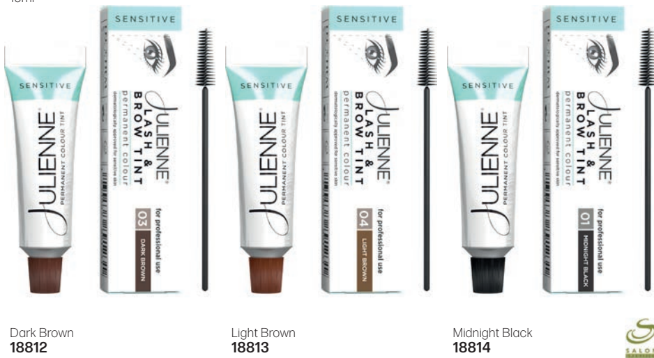
Dark Brown 18812

The perfect lash & brow tint solution for sensitive & allergy-prone skin. Dermatologically approved, hypo-allergenic formula that delivers rich color to brows, but is gentle enough to be tolerated by the skin. The skin is much less likely to look & feel irritated, helping the newly applied color look as natural as possible. 15ml