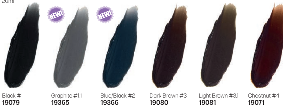
Black #1 19079

Created for the salon professional, the new & improved Apraise lash & brow tint is 100% vegan & PPD free. Offers higher shine, better coverage & stronger staining power. The water-resistant, smudge-proof formula lasts up to 8 weeks & visibly transforms the appearance of lashes & brows, achieving the perfect shade every time. 20ml