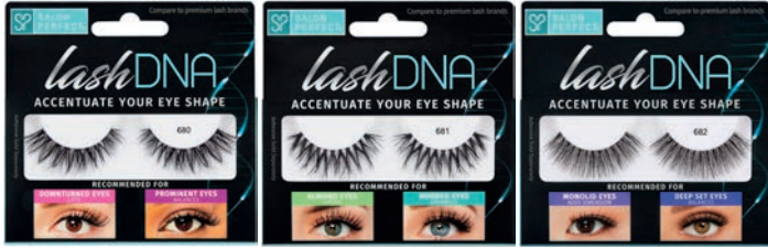
680 - Downturned & Prominent Eyes 16409

Discover the best lashes for each individual eye shape. Designed to work with unique eye shapes to provide the most flattering lash fit. Three styles made to hug & highlight the eyes for a custom fit. Accentuate each eye shape for downturned & prominent eye shapes. Each pack contains one pair of lashes.