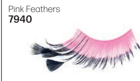
Pink Feathers 7940