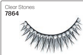
Clear Stones 7864