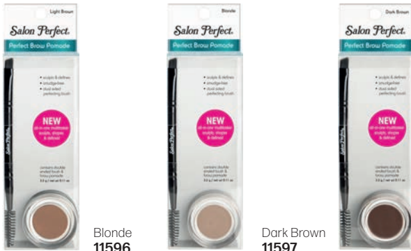
Light Brown 11450

Creamy, long-wearing brow color that defines, sculpts & fills in eyebrows for that coveted full look. It is a multi-tasking superstar that combines the work of a pencil, powder & wax in one easy-to-use product. 3.2g