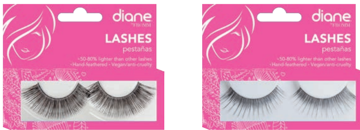
Bold #1 11480

Created using the finest synthetic materials with hand-feathered tips to look just like real lashes. Vegan & cruelty-free using no animal or human hair. 50-80% lighter than lashes currently on the market. High end quality without the high end price. Thin, flexible band fits most eye shapes.