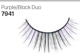
Purple/Black Duo 7941