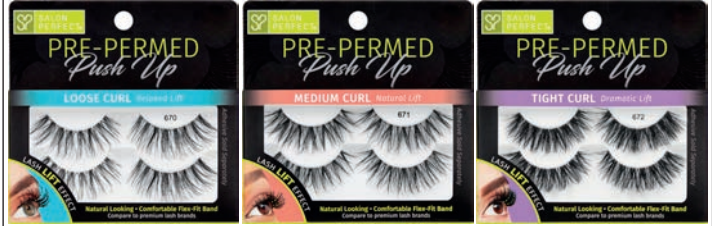
670 - Loose Curl - Relaxed Lift 16423

Just like a lash perm without the need for a lash lift. Provides a natural-looking curl without the need for tools, curlers or chemicals. Choose from loose to tight curl styles for a lift to suit any client. Lashes look natural thanks to the comfortable flex-fit band. Each pack contains two pair of lashes.