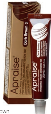
Dark Brown 10563