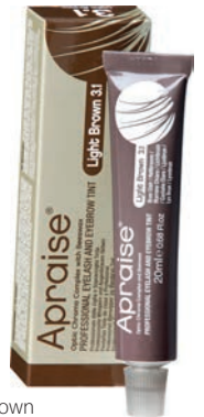
Light Brown 10564