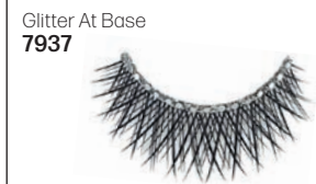
Glitter At Base 7937