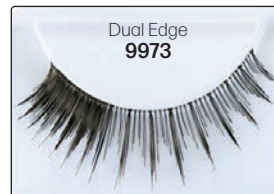
Dual Edge 9973