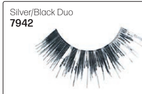
Silver/Black Duo 7942