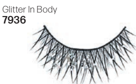
Glitter In Body 7936