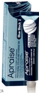
Blue Black 10562