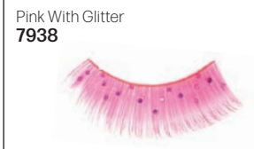
Pink With Glitter 7938