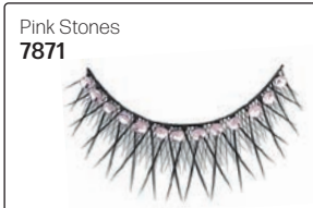
Pink Stones 7871