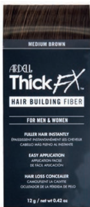
Medium Brown 12980