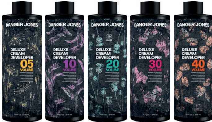
5 Volume 19484 10 Volume 19485 20 Volume 19486 30 Volume 19487

Deluxe Cream Developer Creamy consistency & active ingredients of Jojoba Seed Oil & Aloe Leaf Juice help provide extra moisture when mixed. Specifically designed to pair with Danger Jones Powder Lightener & Color Remover. 100% vegan & gluten free. No animal testing. 946ml